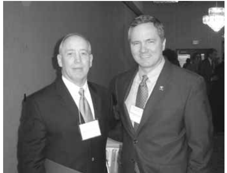
DHEC Commissioner Earl Hunter and Senator Bobby Harrell strike a pose for the camera.